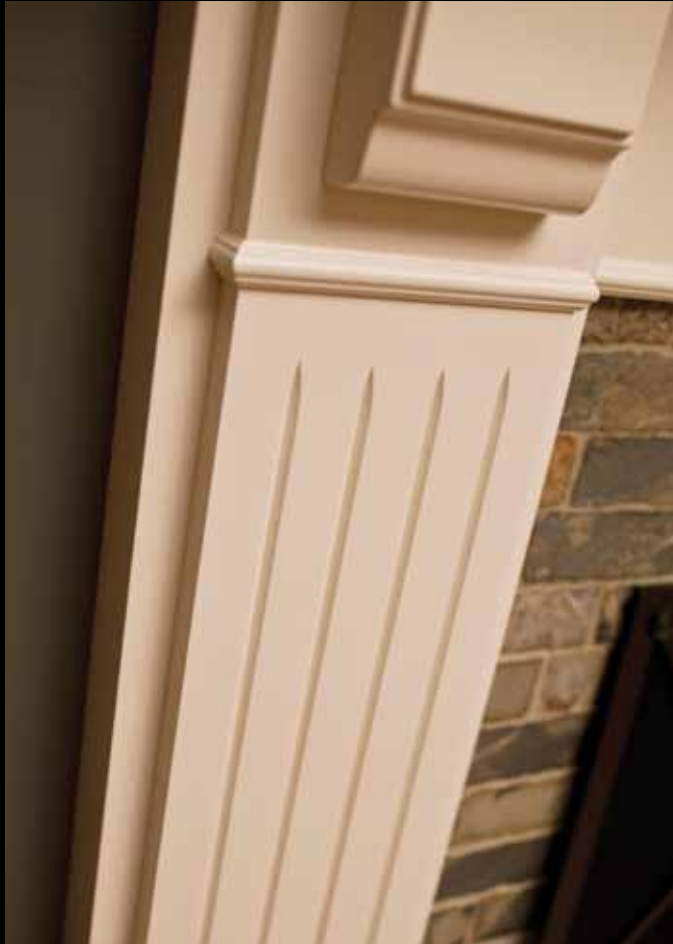
Optional fluted column shown (Column "C").

Carved corbels are the defining architectural element for this fireplace mantel from Dura Supreme. With its crisp, white paint and simple design, this mantel fits right in with its cottage surroundings. Dura Supreme's fireplace mantels can be selected with a variety of woods and finishes to create the look that's just right for your home.