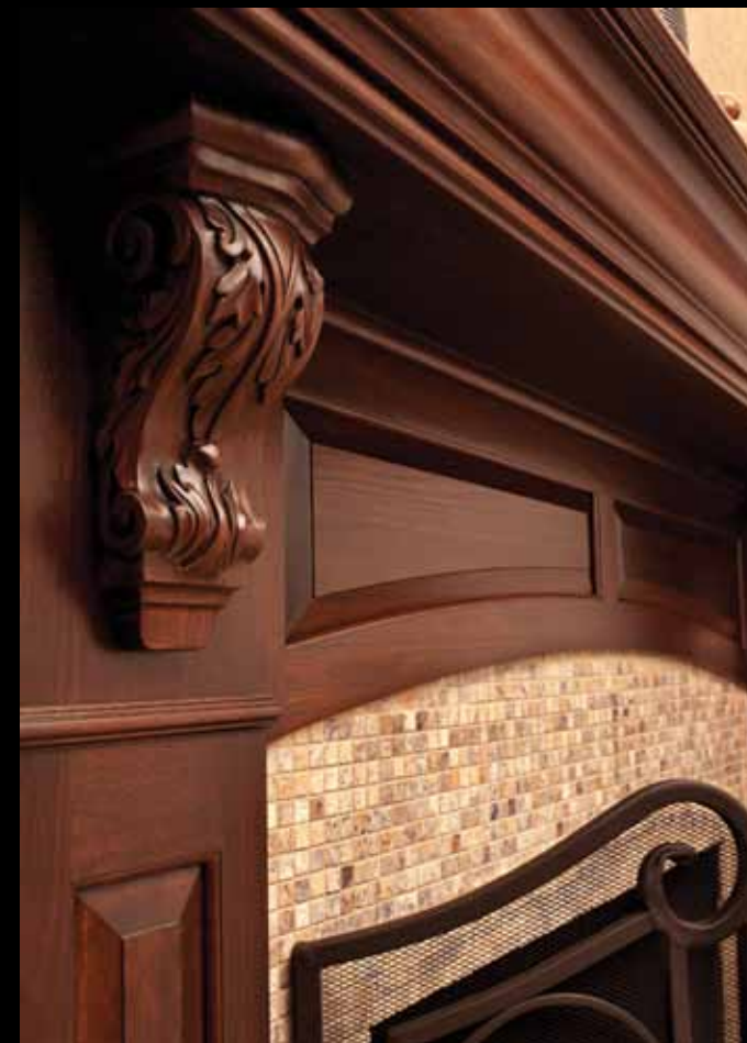
Optional arched Frieze “C” shown.