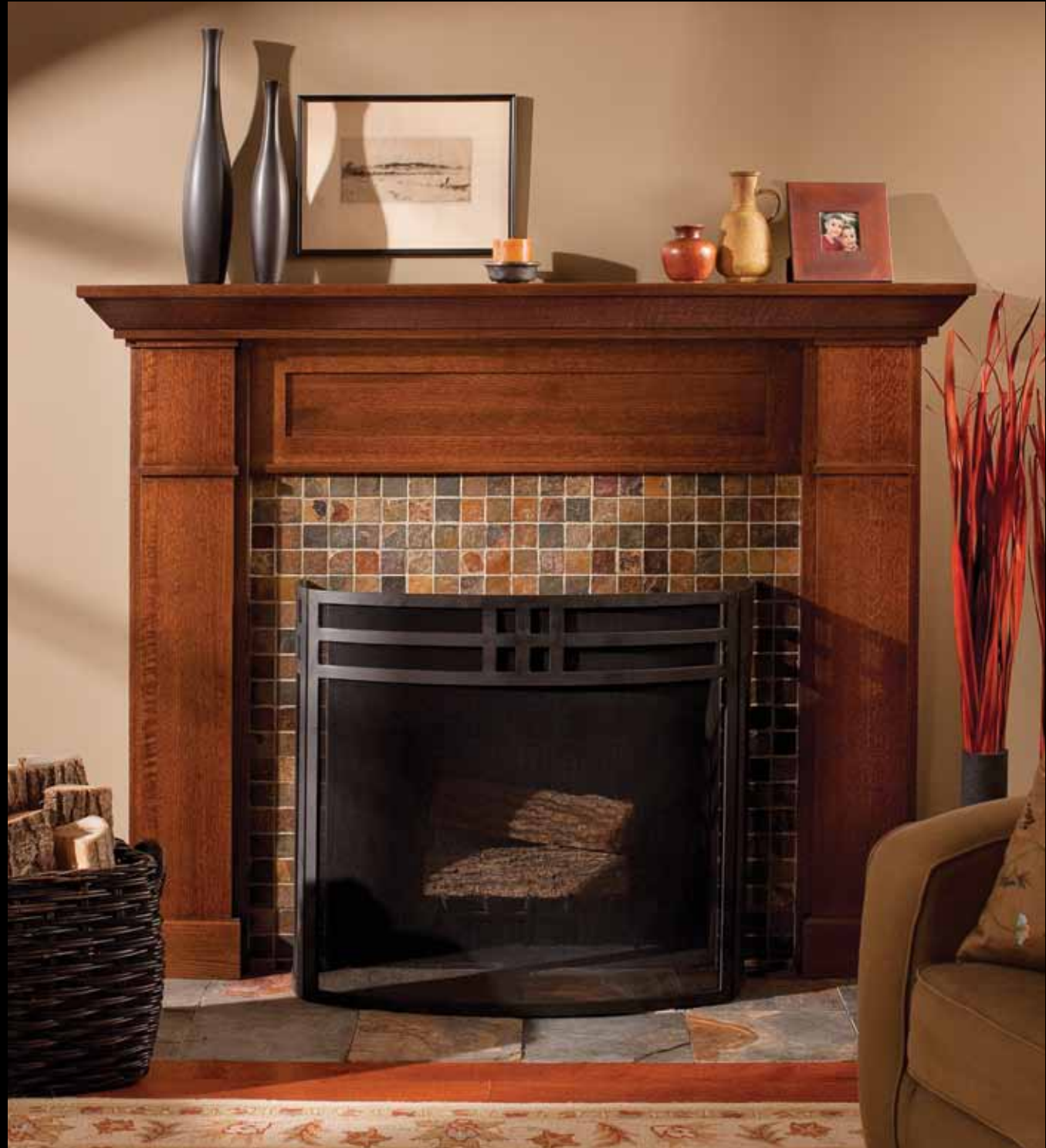
Mantel "B" shown in Quarter Sawn Red Oak wood species with Mission/Charcoal Glaze finish (Craftsman Styling, Frieze "B", Column "A").