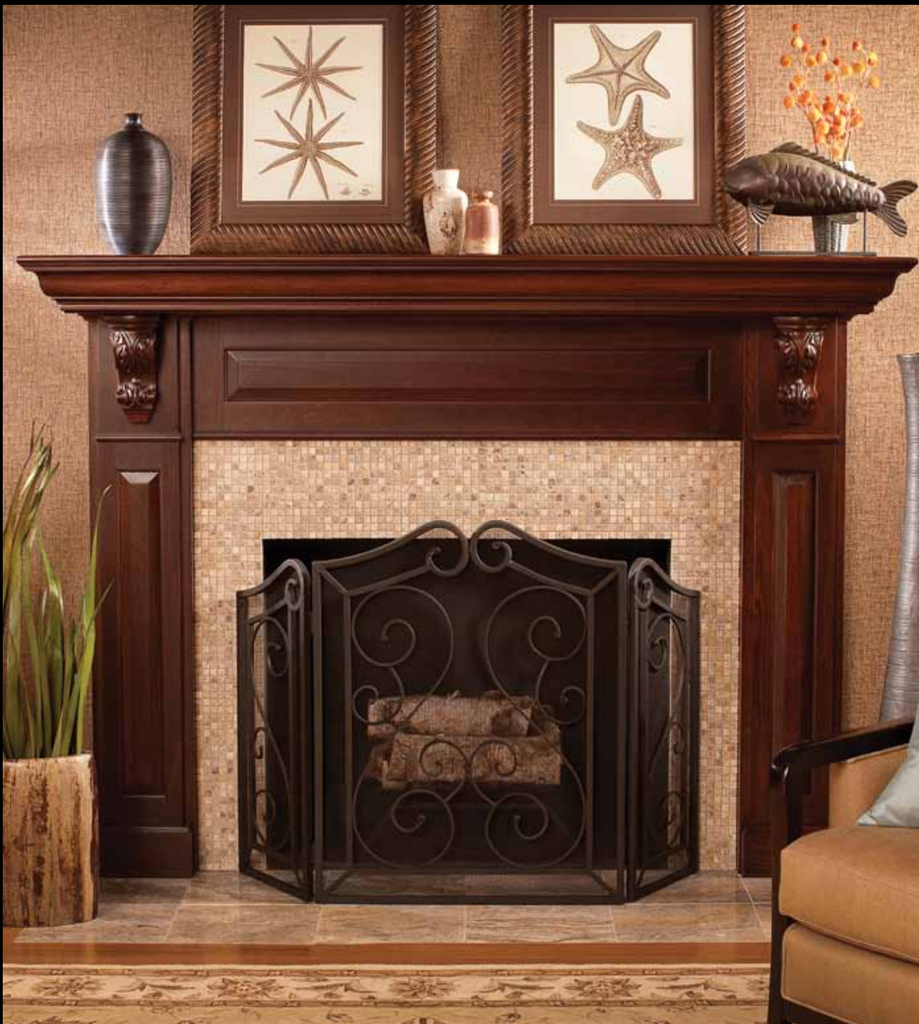
Mantel “A” shown in Lyptus wood species with Chestnut/Charcoal Glaze finish (Classic Styling, Frieze “B”, Column “B”).

This stunning fireplace mantel from Dura Supreme features carved corbels below the mantel shelf. When “Classic” Styling is selected, the corbels feature an ornate, acanthus leaf carving. Decorative panels were selected for the frieze and the columns. Crafted from Lyptus wood species, the rich color and unique grain pattern create an elegant focal point for this great room.