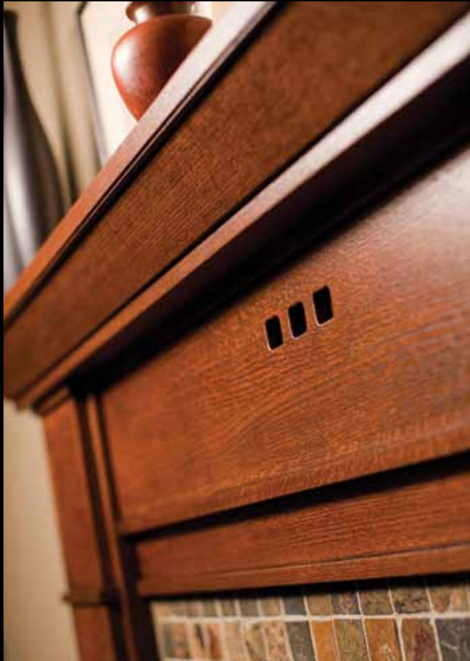
The Frieze "D" option includes a carved "3-square" motif.

This craftsman-styled mantel from Dura Supreme is an appropriate complement to the bungalow architecture of this home. The simple molding details and linear elements of this mantel create a striking architectural focal point in the family room. Fireplace mantels from Dura Supreme can be designed to showcase the architectural style of the home.