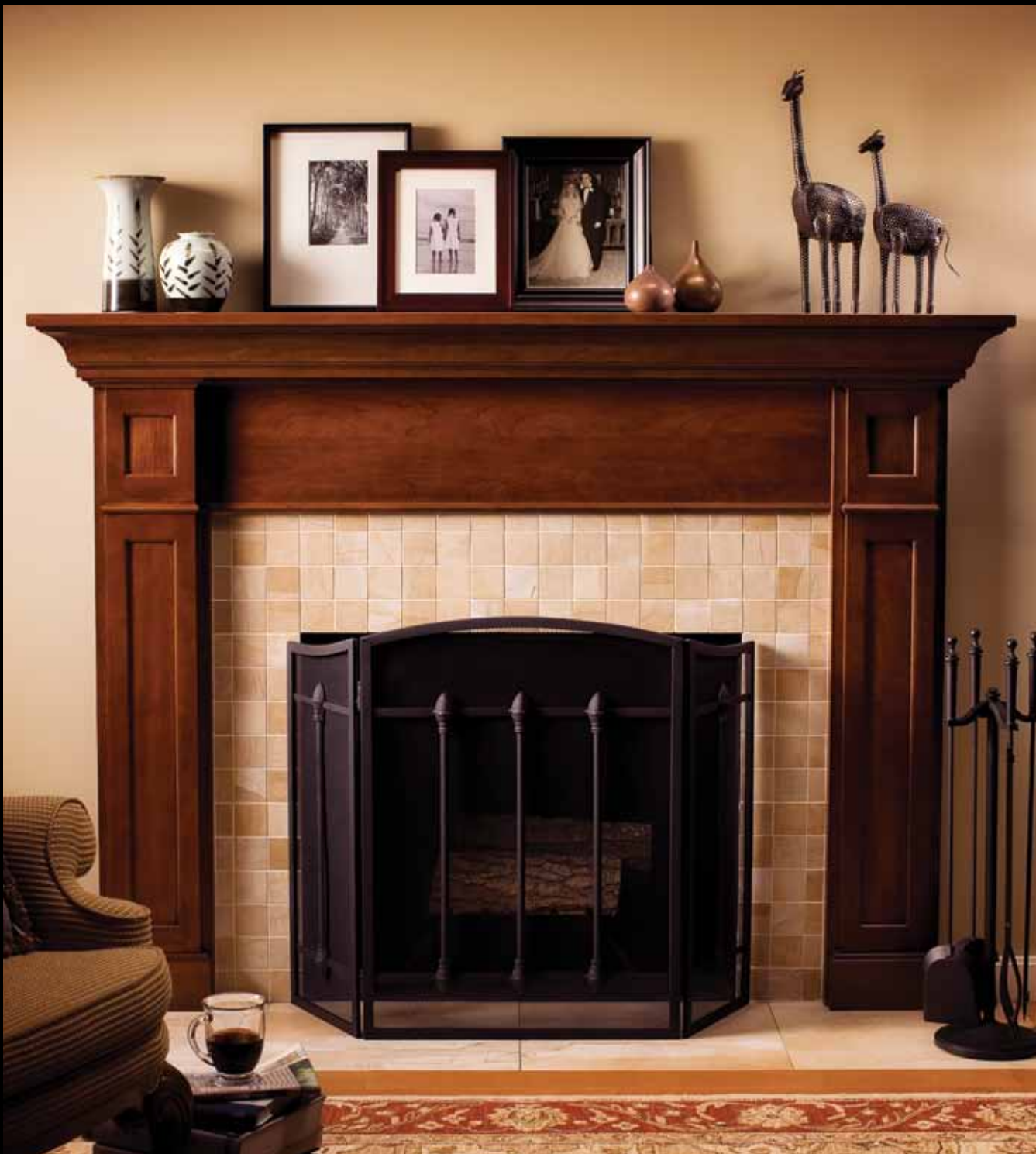
Mantel “C” shown in Cherry wood species with Cinnamon/Charcoal Glaze finish (Transitional Styling, Frieze “A”, Column “B”).

Traditional Cherry hardwoods look rich and elegant framing a fireplace, especially when the styling and finish complement the cabinetry in the rest of the home. For this mantel, “Transitional” Styling was selected for the refined cove moldings used to create the mantel shelf. Decorative panels selected for the columns, blend perfectly with the cabinetry door style in the kitchen.