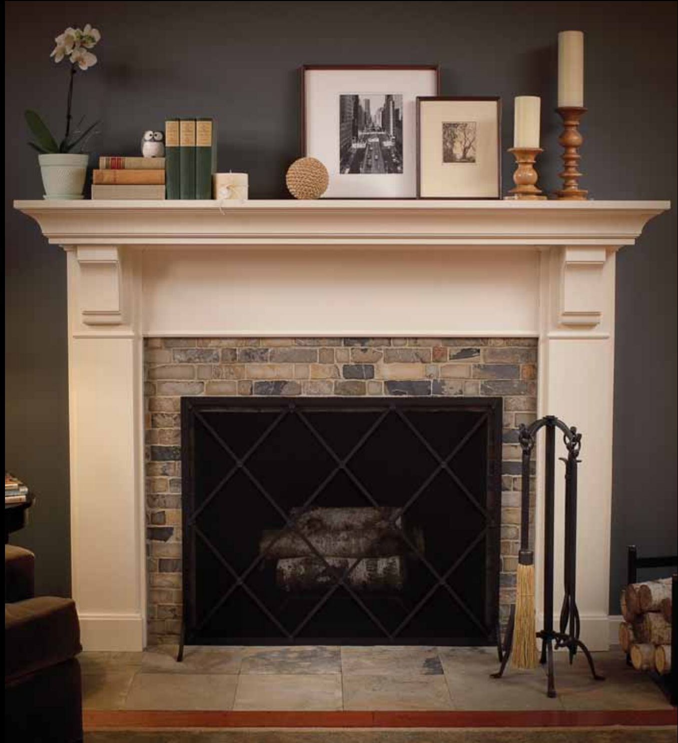
Mantel "A" shown in Antique White paint on Maple (Transitional Styling, Frieze "A", Column "A").