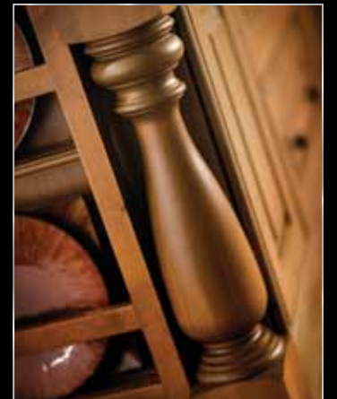
A few of the Turned Post options for Tables and Islands are pictured above.